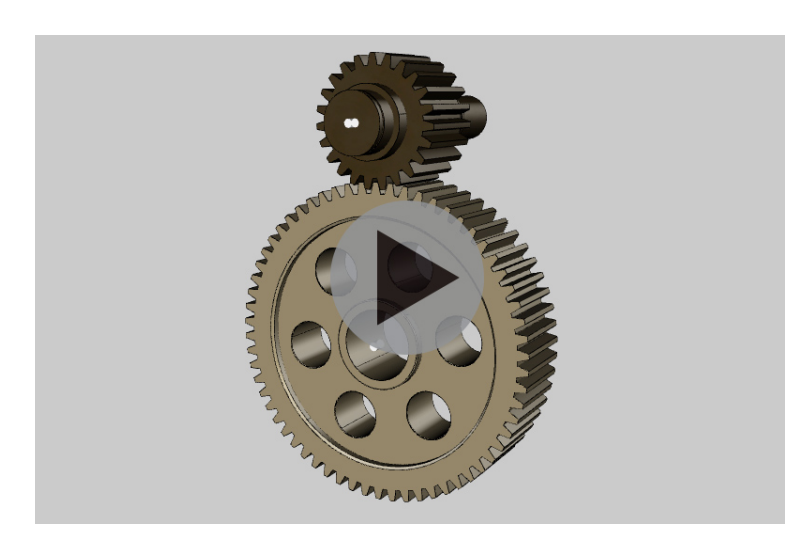
Gear Assembly modeled by Jesse Luis. 3D motion simulation in Kinetics. (Click to activate.)

Simulate motions in Kinetics —define time-based, rigid body studies using kinematics or dynamics. Determine motion optimization by evaluating actuator force and joint loads. Assess product performance through it's cycle of operation. Analyze the design for range of motion, part displacements and overall performance.