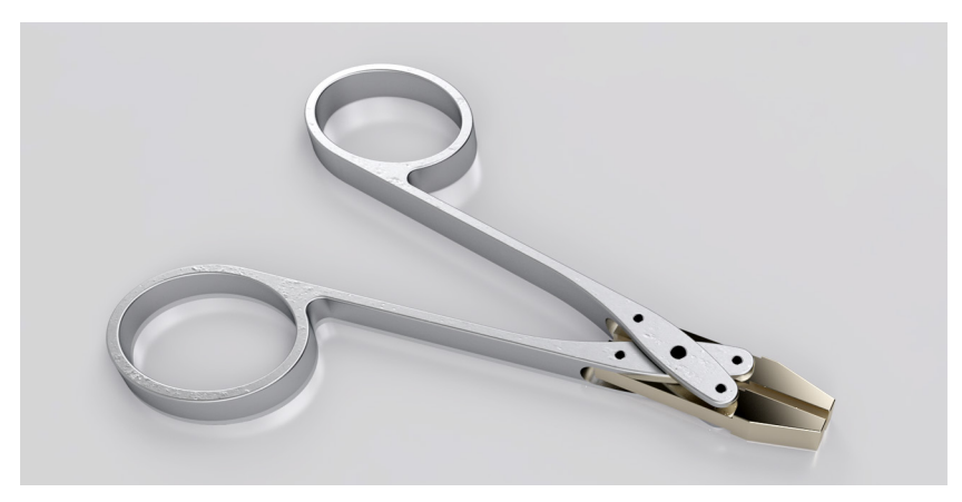
Watchmakers' Tongs designed and modeled in Xenon by John Bicht. Materials set up and rendering in Kinetics.

Render with realism —Apply materials from the extensive library then render in real time for high quality visualization.